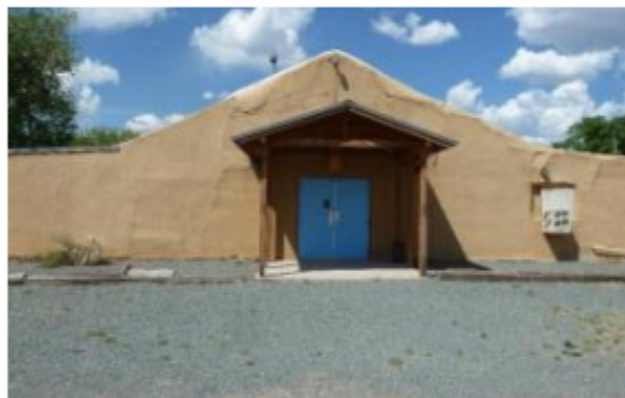
Nike Bar, Carrizozo, NM

Friday, 5-8 PM Registration and fellowship